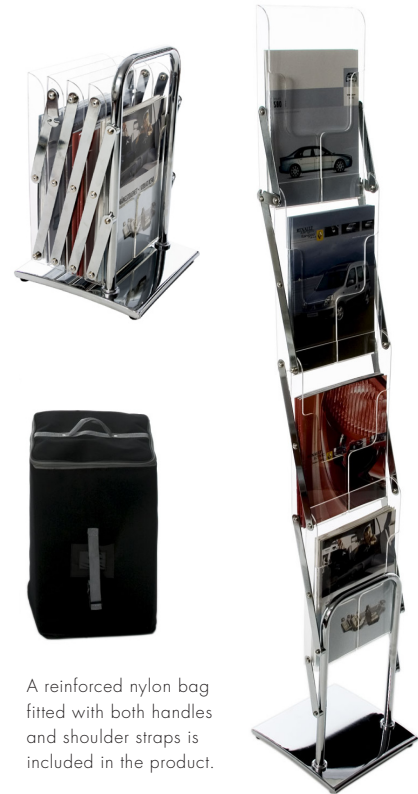
A reinforced nylon bag fitted with both handles and shoulder straps is included in the product.