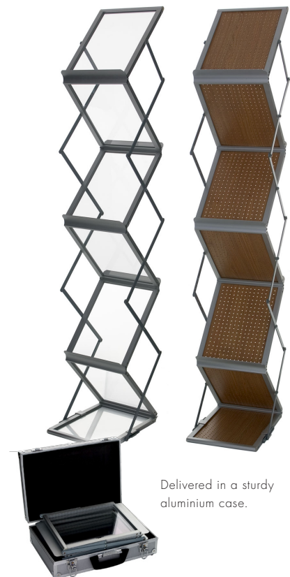
Delivered in a sturdy aluminium case.