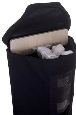
A complete Textile Counter fits in this flexible transport case on wheels.