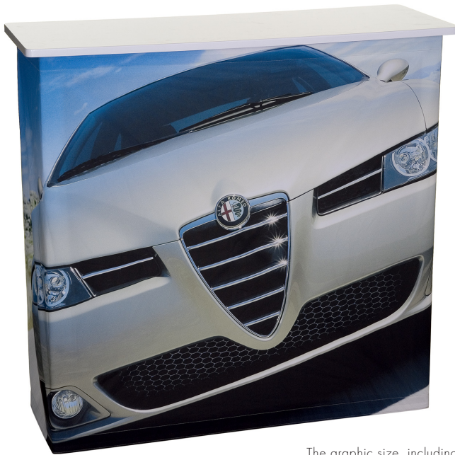
The graphic size, including ends, is 174 x 100 cm.

THE TEXTILE COUNTER S10 IS THE practical starting point for all marketing activities. The textile image wraps around the structure and at the back of the counter you find shelves enabling storage of personal things, brochures etc. Combine with the Pop Up Textile S30 for a full showcase solution.